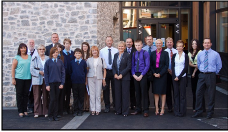
Handover Day : 16 August

Six OSP Student Ambassadors joined the Leadership Team and the ject Team when Phase 1 of the new school was handed over officially.