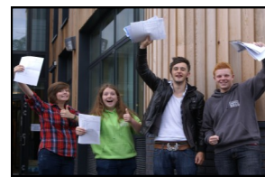
Sixth Form and Year 11 Students celebrated their exam successes in August.

A level students gained particularly impressive results this year with high levels of success in gaining University places.